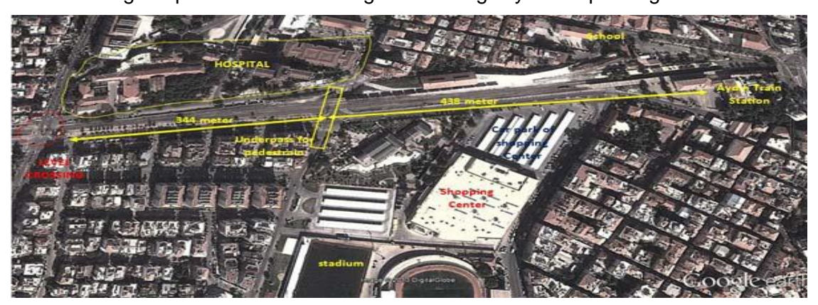
Figure 1.1-1: Location of Aydın Station

The measures include physical measures preventing access to the railway area and behavioural measures informing the public about the dangers and illegality of trespassing.